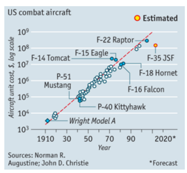
Figure 1. Augustine's 16th Law ("Defence Spending In A Time Of Austerity," 2010).

In the year 2054, the entire defense budget will purchase just one aircraft. This aircraft will have to be shared by the Air Force and Navy 3½ days each per week except for leap year, when it will be made available to the Marines for the extra day. (p. 12)