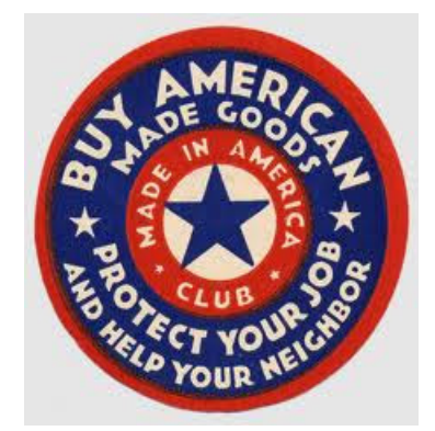
Figure 3. Buy American Act

The Buy American Act, passed in 1933, was rooted in the belief that by increasing the government purchase of domestic goods, the United States could lift itself out of the Great Depression. As its name implies, the act gave preferential treatment to the use of American-made products. Today, the act contains three original sections and two additional ones.